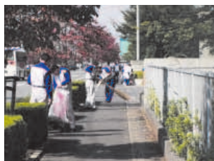
Cleaning streets around the factories (Saitama Manufacturing Division)