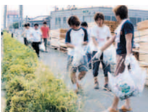
Annual Cleanup Campaign by the Utsunomiya Manufacturing Division