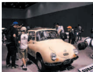
Subaru Visitor Center (exhibition hall)