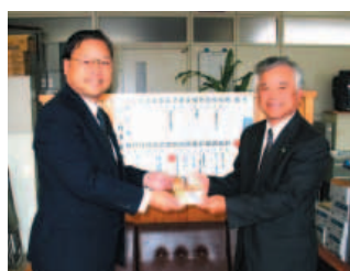
Green Fundraising (Utsunomiya Manufacturing Division)