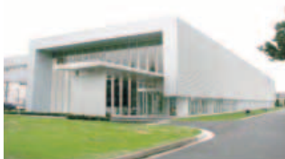
Subaru Visitor Center (external view)

The first floor of the Subaru Visitor Center houses an entrance atrium, which expresses a wonderful encounter between people and cars created by Subaru technology, and an exhibition hall. In the exhibition hall, you can see a Subaru 360, which played a role in the start of Japan's motorization, and the Impreza WR car, which participated in the World Rally Championship recognized as the summit of motor sport competition just like Formula 1 (F1). On the second floor, there are technology and recycling laboratories where Subaru's future-oriented technologies and environmental efforts are exhibited.