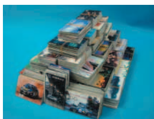
5,000 prepaid cards collected (Head Office)

As for employee volunteer activities, we continue donations by collecting used stamps, prepaid cards, and bellmarks, and participate in the Green Fundraising campaign. This year again, the FHI Head Office donated used stamps and prepaid cards to JOICEF (Japanese Organization for International Cooperation in Family Planning) and sent bellmarks to the Bellmark Education Foundation through the Sankei Living Shinbun Inc. The Utsunomiya Manufacturing Division conducts the Green Fundraising campaign every year. This year, the collected funds were given to the Tochigi Green Promotion Committee and turned into 3,000 seedlings.