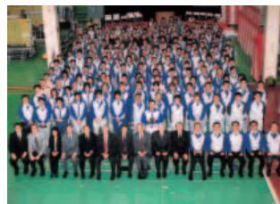
The awards ceremony of Boeing 2002 Supplier of the Year

In April 2003, at the Utsunomiya Manufacturing Division, there was an award ceremony for the Boeing 2002 Supplier of the Year (the ceremony