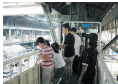
Children on a plant tour

The Gunma Manufacturing Division invites elementary school children for plant tours to help them understand the relationship between society and automobiles—how automobiles are made and work. We also have a website accessible for children to study, called "Subaru Virtual Land Plant Tour." ( http://www.fhi.co.jp/child/index.html )