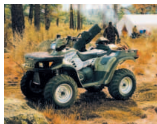
Award winning Polaris's four-wheel buggy, the ATP

The ATV of Polaris "ATP (All Terrain Pickup)," which is equipped with the