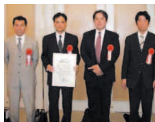
Researchers received the award

The Homogeneous Charge Compression Ignition (HCCI) combustion technology is drawing attention as an ultimate, ideal system for internal combustion engines. FHI researchers were recognized for demonstrating the operation of a gasoline engine in HCCI mode, using commercial