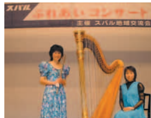
The 27th Friendship Concert (February 2003)