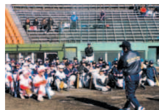
Children taking a baseball class

Our baseball team represented Ohta City in the Intercity Baseball Tournament and made it to the quarterfinals in 2003. With appreciation for the public support of our team, we organized baseball classes for children in order to make a contribution to the development of children's sports within the community. In October, we held the First Subaru Cup Baseball Tournament for Children in Gunma. Our track and field team entered the New Year Ekiden Road Relay for the fourth consecutive year. The New Year Ekiden Road Relay is held for all Japanese company teams on New Year's Day in Northern Kanto Area. As a company from Gunma Prefecture, we received enthusiastic support from local residents.