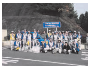
Cleaning streets around the Test & Development Center (Kuzuu machi, Tochigi)