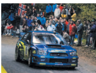
World Rally Championship

In Europe, where the automotive culture was born, motor sports are very popular and are a part of people's lives. In order to further develop and promote the automotive culture in Japan, we are involved in many activities at home and abroad, and participate in the World Rally Championship (WRC) and the Japan GT Championship.