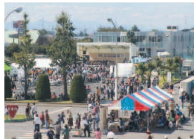
The 50th Anniversary Subaru Appreciation Festival

FHI promotes exchanges with the people of the community by participating in a variety of local events and by holding annual events for the public. The Gunma Manufacturing Division holds the Subaru Friendship Concert organized by the Subaru Community Exchange Association. This annual concert is free of charge, but people who come to the concert are requested to bring household commodities such as towels, tea, soap, or detergents for donation to local welfare institutions. In fiscal 2003, we had three concerts: the 25th Concert on July 27; the 26th on September 26; and the 27th on February 27. 500 people came to the 27th Friendship Concert and many commodities were donated. At our Flower Planting Activities that the Gunma Manufacturing Division held in fiscal 2003, 22,000 seedlings were distributed to people. At the Utsunomiya Manufacturing Division, employees gave a karate class (customs and manners) to 30 mentally disabled people of high school and junior high school age.