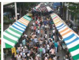
Subaru Appreciation Festival drew 35,000 visitors (Gunma Manufacturing Division)