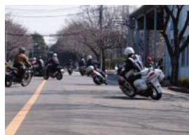
Class on Safe Motorcycle Driving (Tokyo)

The Gunma Manufacturing Division has implemented education that includes real-life experiences of safe driving as part of their voluntary traffic safety promotion activities. This education is designed, in addition to providing instruction in driving techniques, to teach drivers about different perspectives on driving, for example the way drivers' actions can be dangerous to pedestrians and how to make a right turn in a safe, timely manner.