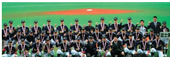
FHI's hardball baseball team was victorious in the 33rd Amateur Baseball Japan Championships in November of 2006