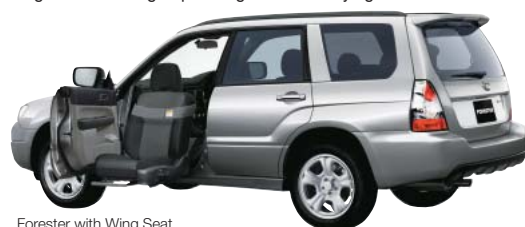
Forester with Wing Seat

Subaru offers a wide selection of TransCare automobiles, from mini-car Stella and wagon Sambar, to the Legacy, a standard-sized car. In response to the increasing demand for wheelchair accessible vehicles, our Sambar mini car offers an electrically operated wheelchair lifter*4 that allows for loading and unloading of passengers in wheelchairs, including TransCare Wing Seat*3 series, which help to load and unload smoothly. We also offer a type equipped with a stretcher*5, which allows for loading and unloading of passengers who are lying down.