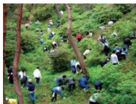
Cleanup of Kanayama participated by 350 employees (Gunma Manufacturing Division)

Cleanup of Kanayama *2 as one of the Subaru Community Exchange Activities (350 participants)/Environment beatification activities (About 200,000 participants in total a year)