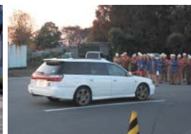
Real-life experience education of safe driving (Gunma)