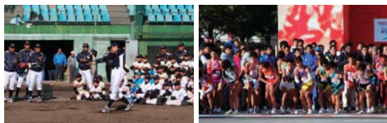
The baseball class for elementary and junior high school students hosted by FHI's hardball baseball team