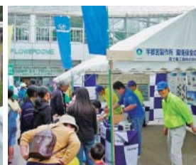
Environmental Exchange drew local elementary school students (Utsunomiya Manufacturing Division)