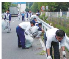
Pikapika Kitamoto Omakase Program participated by 819 employees in total (Saitama Manufacturing Division)

Tokyo office : Office Tour for elementary school students (5 local elementary schools, 410 participants)