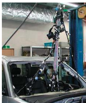
Advances in wire harness dismantling

Because a large amount of copper is used in a wire harness, if the wire harnesses can be removed before the ELVs are shredded, the collection and separation of iron and copper will be en-