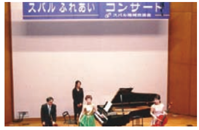
Concerts are staged free four times a year for the public. Homegrown performers are invited to play, and flowers, seeds and saplings are given away to the audience at these concerts to promote environmental activities. They have grown to be quarterly events, attracting an audience of