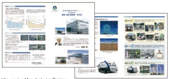
Utsunomiya Manufacturing Division Environmental & Social Report 2008

The Utsunomiya Manufacturing Division issues Site Report (Environmental & Social Report) every year to show our overview to local communities and to use it for deepening exchange with then.