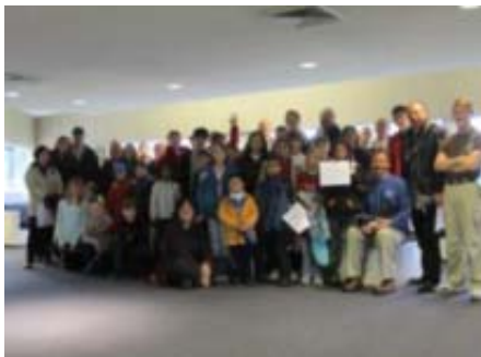
Students and parents enjoying the tour

On December 16, 2011, SRD invited a group of students from 4 to 16 years old from the True Life Educational Home School and their parents (40 participants in total) on a factory tour.