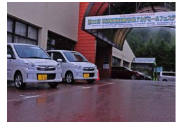
Offered SUBARU cars

The festival is held each August to provide an opportunity for young musicians to receive lessons from internationally acclaimed players. Concerts by these musicians were also held. FHI will continue to support cultural activities such as this into the future.