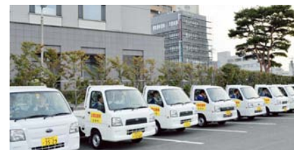
SAMBARs lent out free of charge