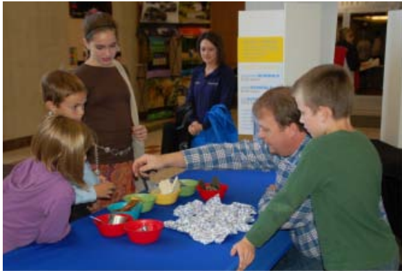
Students learning about recycling

*1 S.T.A.R.S. : Students and Teachers Achieving Recycling Success