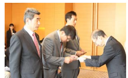
7th Volunteer Awards

tivities to support people in the areas affected by the Great East Japan Earthquake. In our 7th Volunteer Awards, the Earthquake Disaster Award was specially set up and 14 employees who helped people in disaster-affected areas were each honored with a medal of appreciation.