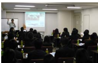
Students on the company tour

In each visit we always receive a number of questions from the students, such as why we chose to work for FHI and about the fulfillment that we find in our jobs. Recently, we find that more and more students are interested in the work-life balance and active promotion of female workers.