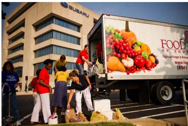
SOA employees help load food donations collected from our employees

SOA is working to alleviate the food insecurity suffered by some in the U.S. through several food supply projects. In 2011, we donated 142.5 tons of food and fresh produce through various hunger initiatives, such as Subaru Drive Out Hunger, and Subaru Share-the-Love Gardens, conducted in Colorado and New Jersey.