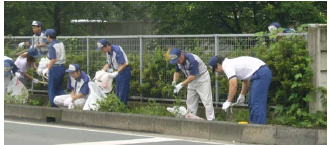
Shiny Kitamoto Cleaning Program

Saitama Manufacturing Division conducts a monthly cleaning scheme called "Shiny Kitamoto Cleaning Program" to sweep and tidy the area around the plant. Many employees participated in the cleaning each month (except the period of severe heat) in FY2012. We aim to continue our contributions to clean community near our business sites.