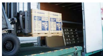
Power generators and other goods to be delivered

Ota City offered 100 private let-properties within the city at no charge for two years, and we offered temporary jobs manufacturing SUBARU cars.