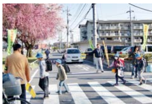
Traffic safety support near schools

As a member of the traffic society we actively promote awareness among employees by providing accident prevention meetings before holiday seasons and other occasions.