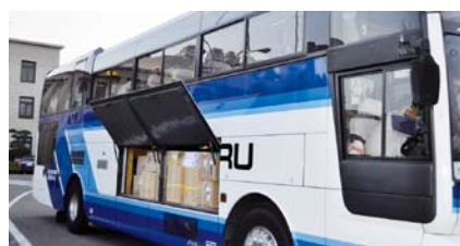
Support goods to be delivered