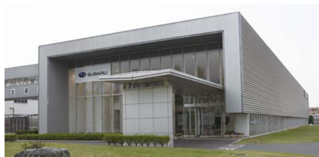
SUBARU Visitor Center

The SUBARU Visitor Center opened on July 15, 2003. This facility introduces SUBARU's past models, models that set world records, SUBARU efforts to develop unique technologies and approaches to the environment. In FY2012, 67,494 people came to see the facilities. (In 2011, the Center was closed from April to September because of the Great Earthquake Disaster.)