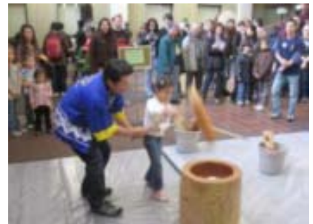
Employees helping in the rice cake making

On January 7, 2012, SRD co-sponsored and participated in the Mochitsuki (rice cake making) Festival with the Japanese Student Association. We enjoyed making rice cakes with people from the local community and also donated 500 USD to the festival.