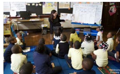
Children's Literacy Initiative