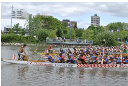
SCI teams competing in the final race

In the 8th race in 2011, the final stage was competed by the two SCI teams, with Team No. 2 finishing first and No. 1 second. A total of 50,000 Canadian dollars was donated by all the participating teams to the Betty Wallace Women's Health Centre in Canada.