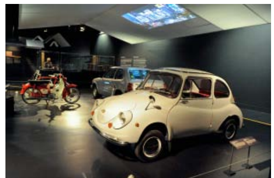
SUBARU 360 displayed in the exhibition

SCI sponsored an exhibition called "Japan: Tradition. Innovation." held at the Canadian Museum of Civilization from May 20 to October 10, 2011. The exhibition covered the history of Japanese culture—known for the craftsmanship and technology that has influenced the world—with the SUBARU 360 on display as one of the main features to entertain visitors. The exhibition was enjoyed by around 1.2 million people. For added exposure, 12 hotels in the Ottawa-Hull area issued 10,000 room keys printed with the name of the exhibition.