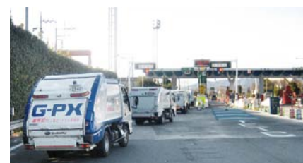
Six garbage collection vehicles ready for dispatch

We also offered 10 SUBARU SAMBARs that had been used as company cars, and other support goods. The cars and goods were delivered by Gunma Manufacturing Division employees to the disaster-affected area.