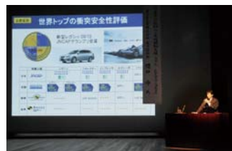
Young driver training