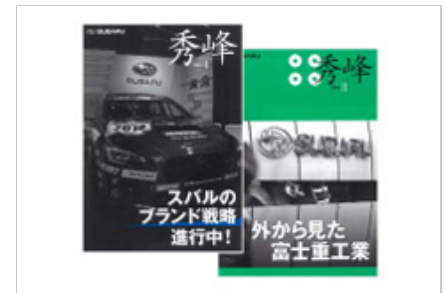
In-house magazine "Shuho"

FHI also has a means to promote direct communication with employees through periodical visits by management to each place of business and workplace.