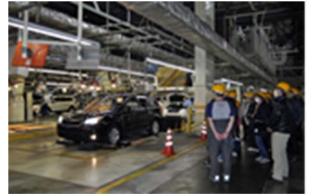
Plant tour for shareholders in FY2014