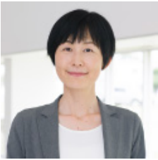
Rumiko Iwasada Auto Journalist

In addition to vigorously compiling information mostly on compact automobiles, she focuses on people, roads, autos and medical treatment to find ways to reduce traffic accidents, injuries and deaths. She works as an investigative commissioner for the Ministry of Land, Infrastructure, Transport and Tourism among others, providing suggestions and proposals to benefit transportation for society and formulate transportation related government policy from a citizen's perspective. She also focuses her efforts on providing lectures for instructors at various driving schools and participates in safe driving programs.