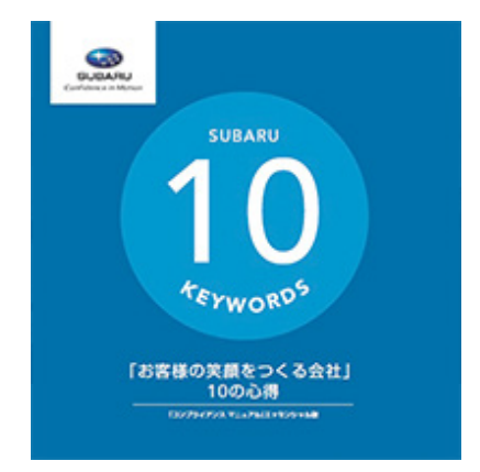
Compliance Manual-Essential Version