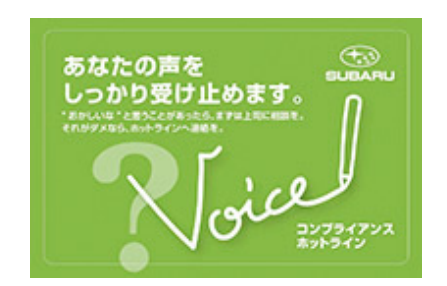
Compliance Hotline Card