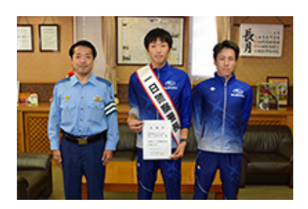
Letter of Appreciation from Ota Police Station

After the event, the team received an appreciation letter from Ota Police Station.