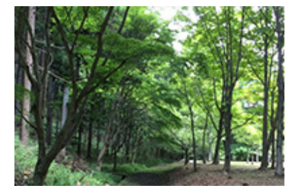
Subaru Forest Utsunomiya (Tochigi)