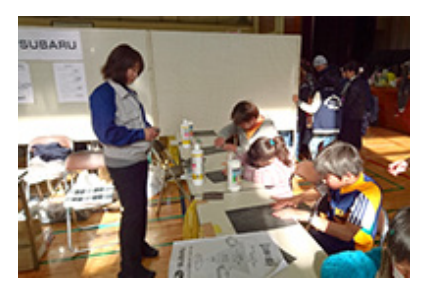
Making key chains

In November 2017, the 8<sup>th</sup> Ota Town Teachers Trade Fair organized by the Ota Town Teachers Trade Fair Promotion Association was held in Ota municipal Watauchi Elementary School, and Gunma Plant participated in the fair. At our booth, some 200 visitors created their own key chains with Subaru marque, and children who are to become future leaders of monozukuri had fun learning.