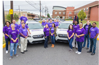
SOA employees delivering books to schools