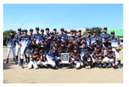
Subaru Cup champion team and Subaru baseball team

In October 2017, Subaru baseball team held a baseball class in Yajima Ground. This was held as a sub-prize to the champion team (Niragawa Nishi West Giant) in the Subaru Cup, a baseball tournament in Ota City. On that day, Subaru team played a game with the champion team and taught children that baseball is both difficult and fun. The Subaru team also coaches children in Musashino district in Utsunomiya.