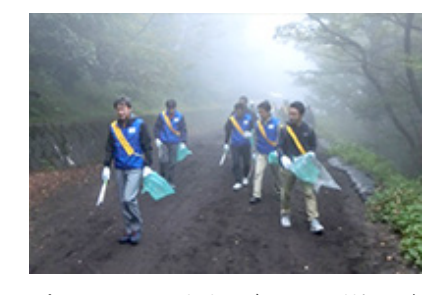
Cleanup activity (Mt. Fuji's 5<sup>th</sup> station)

In September 2017, Mt. Fuji Beautification Foundation held a cleanup activity from its 5<sup>th</sup> station to 6<sup>th</sup> station, in which Subaru employees also took part. Subaru has been providing funds to support the foundation's activities, which are used for the beautification of areas around Mt. Fuji. In FYE2018, as part of Subaru Forest initiative, Subaru made and donated nine bicycle stands using the thinned wood from Bifuka Town, Hokkaido, to the Public Corporation Fuji Toll Road Management Office that manages the Fuji Subaru Line.