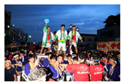
Subaru employees carrying the mikoshi