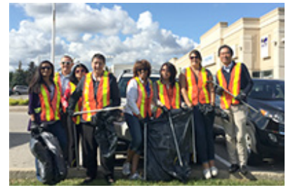
SCI employees participating in a cleanup activity