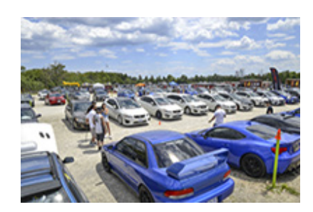
Subaru automobiles of various types and colors came together

In July 2017, Subaru Canada, Inc. welcomed the Toronto Subaru Club and enthusiasts from all over the Greater Toronto Area to our headquarters for the 14<sup>th</sup> Annual HyperMeeting. This year over 1,400 attendees came out to share their pride of Subaru ownership, showcase their vehicles and enjoy a day of family-friendly fun. With a complimentary BBQ and events for children, the event was once again a huge success. As in previous years the proceeds of the event will go to Ronald McDonald House Charities Toronto, and this year Subaru is pleased to announce that the event raised a grand total of $10,000, which includes Subaru Canada's dollar-for-dollar match of funds raised by the Toronto Subaru Club. As one of the largest events of its kind held at a corporate head office in Canada, HyperMeeting gives us a chance to give back to the community as well as a unique opportunity to connect with some of Subaru's most ardent enthusiasts.