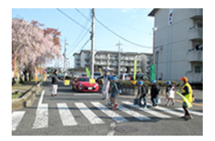
Traffic safety guidance by Subaru employees

As an initiative to call for traffic safety of local children and for improving the employees' traffic manners, Subaru provided traffic safety guidance on streets near the Utsunomiya Plant during commuting hours. As there are many different streets along which children commute to school in the vicinity of the plant, Subaru carried out the guidance twice in April when new pupils start school and in September when pupils might become less careful after the summer vacation.