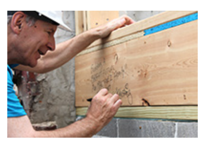
SOA's CEO writing a message of hope