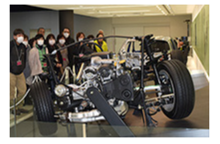
Tours at Visitor Center