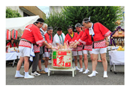
Kagami-biraki (opening of sake barrel) cerebrating the 60<sup>th</sup> anniversary of the birth of Oizumi Town

The 45<sup>th</sup> Oizumi Festival was held for two days in July, and some 600 employees of Oizumi Plant participated in the adult mikoshi parade on the first day. It was a memorable year for both Oizumi Town for marking its 60<sup>th</sup> anniversary of its founding and Subaru for participating in the festival as Subaru Corporation for the first time. Local residents fully enjoyed the enthusiasm and energy of Subaru.