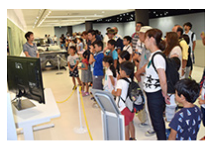
Tours at SUBARU Visitor Center