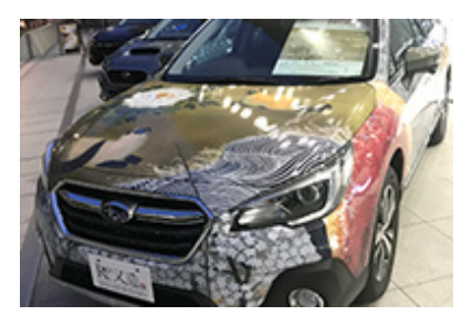
Subaru automobile wrapped with the work of Mr. Kayama

From April to May 2018, Subaru held "Re Matazo Exhibition" in the EBiS303, an event hall in the Ebisu Subaru Building. Subaru Kohsan Co., Ltd. and Subaru sponsored the exhibition, and approximately 17,000 visitors enjoyed the splendid culture and art.