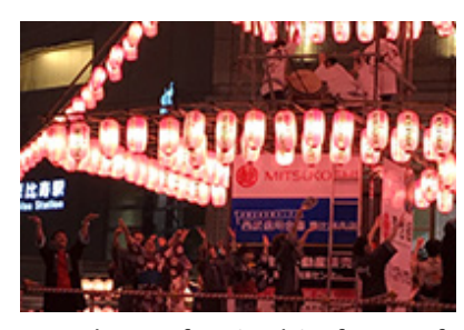
Bon dance festival in front of Ebisu station

The Ebisu Bon Dance Festival started soon after the end of war, with the hope of restoration and reconstruction of the town of Shibuya. It became a summer feature lasting for 60 years, attracting 60,000 visitors in two days. Subaru sponsors this festival as a major contribution to the community.