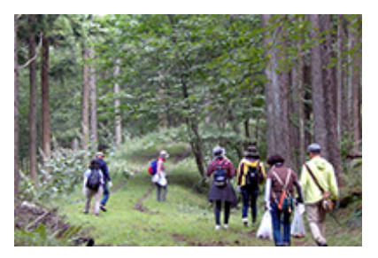
Subaru Friendship Forest Akagi (Gunma)