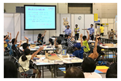
Learning about the difference between four and two wheel drives

In August 2017, Kids Engineers Event was held at Portmesse Nagoya, the International Exhibition Hall. Subaru participated in this event as "Monozukuri Class" in collaboration with Subaru Techno Corporation. At the event, Subaru made models that can easily switch between four wheel drive and two wheel drive, and after completion, Subaru demonstrated how easily a four wheel drive model climb a hill or stairs that the two wheel drive model cannot. About 140 elementary school children had fun participating in making models with us.