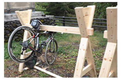
Bicycle stand made with thinned wood