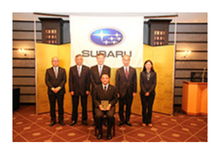
Subaru employees (front row) and officers commended

As a concrete initiative to this end, Subaru commends employees who actively contribute to the community and society through volunteering. This commendation system started in 2006, and in the 13<sup>th</sup> ceremony that took place in June 2018, one employee received the commendation.