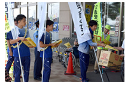
Distributing traffic safety flyer and reflectors