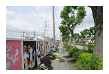
Clean Campaign Activity

Subaru periodically conducts clean-and-beautify your neighborhood activities by employees in the vicinity of our offices and plants. In FYE2018, a total of 350 employees took part in these activities. Subaru plans to continue these local clean-and-beautify activities.