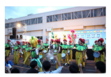
Parade by the Samba Club from the International Christian University

Starting with a parade by the Samba Club from the neighboring International Christian University, the Summer Festival featured various fun events including the annual lottery and presents for children, which were popular among visitors with children. Subaru was able to mingle with a great many people from the community again this year.