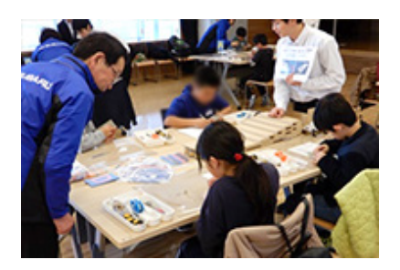
Making model cars

In December 2017, as a cooperative endeavor with Mitaka City Lifelong Learning Center, Subaru and Subaru Techno Corporation together in collaboration held a Monozukuri Class for elementary school children. About 30 students in 4<sup>th</sup>, 5<sup>th</sup>, and 6<sup>th</sup> grades in Mitaka City participated, and made model cars. It was a fun learning opportunity for them to run the cars they made.