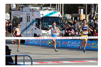
Subaru team finishing in 22<sup>nd</sup> place