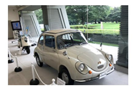
Exhibiting Subaru 360 and Rabbit Scooter

SUBARU maintains its vintage vehicles as a technical heritage. For many people to have the opportunity to see those historic cars and to feel the history of Subaru, Subaru exhibits them at various events.