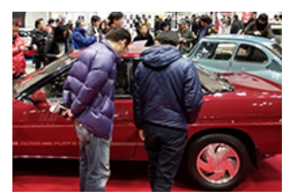
Exhibition of historic automobiles