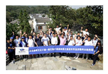
SOC employees participating in the forest conservation activity