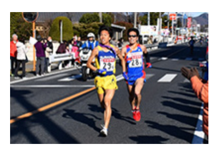
Subaru team athlete running in Gunma

On January 1, 2018, the New Year Ekiden race was held in Gunma Prefecture. The Subaru track-and-field club participated in the meet for the 18th time in a row, and among 37 teams coming from all over Japan to compete, the Subaru team ran in 5 hours 2 minutes 55 seconds and came in 22nd place.