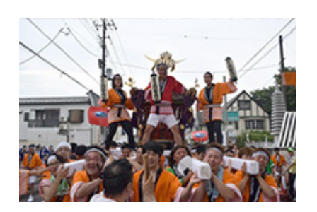
Corporate mikoshi (portable shrine) parade

The Ota Summer Festival was held for two days in August. On the second day, some 1,000 employees joined the corporate mikoshi parade (employees of the Main Plant at the north venue and employees of Yajima Plant at the south venue). It was a beautiful day, and local residents fully enjoyed the enthusiasm and energy of Subaru.