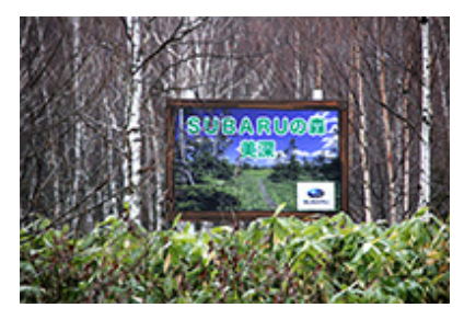
Subaru Forest Bifuka (Hokkaido)

In Bifuka Town, Hokkaido, Subaru carries out conservation and maintenance efforts such as afforestation and thinning in the forest of about 100 ha that Subaru owns in the site of Subaru Test & Development Center Bifuka. In addition to collaborating with Bifuka Town, where the Center is located, Subaru also carries out activities in collaboration with Gunma and Utsunomiya, areas that are also very close to Subaru.