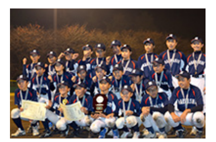
Maebashi All Star Team, second place team