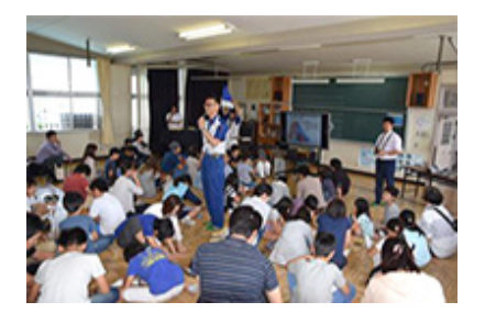
Environment class at an elementary school in Handa City

At the Aerospace Company, school visits have been conducted since FYE2007 to raise children's interest in the field of aerospace so that it becomes an option in the selection of occupation. In this initiative, Subaru employees become lecturers and visit elementary schools in Handa City and Utsunomiya City to talk about and do experiments with materials used in airplanes. It is intended to teach children about the mechanism of global warming and ways to prevent it. A total of 15,641 students from 228 schools in Utsunomiya and Handa have participated since FYE2007, and it has become an initiative rooted in the community.