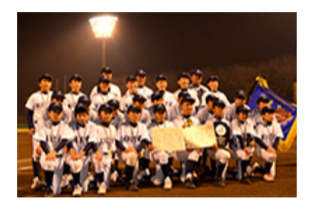
The champion Kiryu Mokusei Team

There participated 20 teams consisting of children in 6<sup>th</sup> grade from elementary schools in Gunma Prefecture. During the months of October and November 2017, the Gunma Prefecture Children's Rubber-ball Baseball Game for Subaru Flag sponsored by our company was held, and Kiryu Mokusei Team and Maebashi All Star Team competed in the final game. Both teams received a commemorating medal from Subaru.