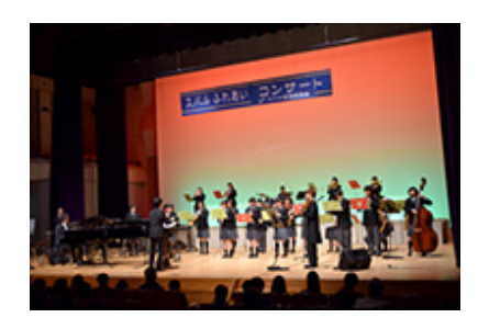
Music performance by music club and brass band of Nishi Oura high school in the local community

Subaru Community Exchange Association held its 65<sup>th</sup> Friendship Concert in the Big Hall of the Oizumi Town Culture Village in December 2017. About 600 people of all ages enjoyed concert and various donations they brought including towels, soaps and money are donated to different social welfare facilities through a social welfare council.