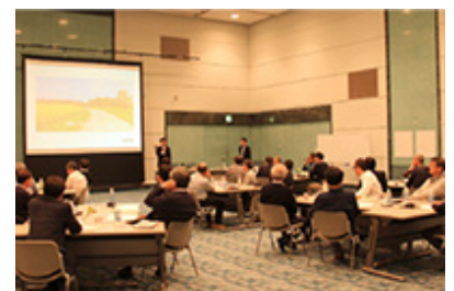
Scene from the executive workshop

To close the workshop, each and every executive made a declaration concerning what they themselves were determined to do to change the culture. After returning to their divisions and workplaces, the executives shared this declaration with their staff and began putting it into action. Adopting the slogan “Progressive change starts from the top,” all executives will play their part to change the culture in earnest.