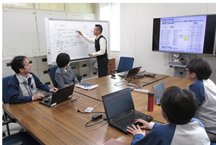
Working group (Product and Portfolio Planning Division)