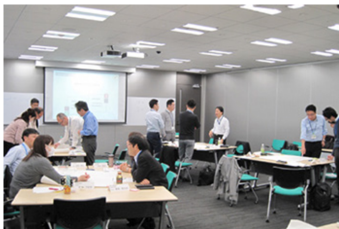
Communication workshop involving all staff (Purchasing Division)