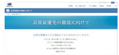
Subaru Website: Putting Quality First

In June 2019, we set up a special section on the Subaru website, entitled “Putting Quality First.” This section provides a detailed timeline and facts concerning the final vehicle inspection problems and explains the current situation, as well as offering information about changes to equipment and systems at our sites and other measures that we have taken to prevent a repeat of such problems. It also describes our efforts to change the culture and implement other company-wide initiatives to prevent recurrence and put quality first.