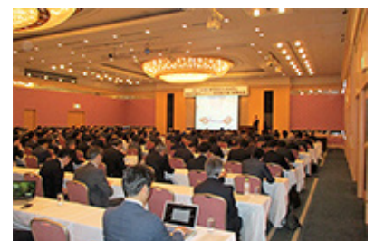
“General Cooperation Meeting” for the Aerospace Company suppliers