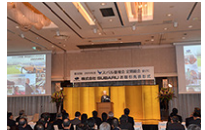
“General Cooperation Meeting” for the Automotive Business suppliers

Also, since it was revealed in October 2017 that there had been improper conducts of final vehicle inspections, Purchasing Division has held meetings and briefings for suppliers to explain the background to the cases and the revision of the production plan for completing measures to prevent recurrence. We will continue to actively communicate with our suppliers and carry out coordination to prevent unreasonable production activities from happening.